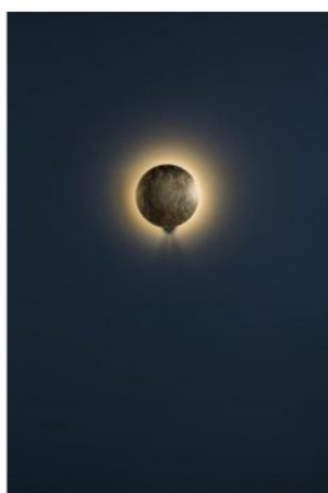
Available Versions Erhältliche Versionen