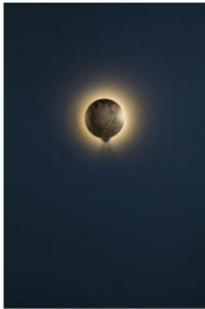
Available Versions Erhältliche Versionen